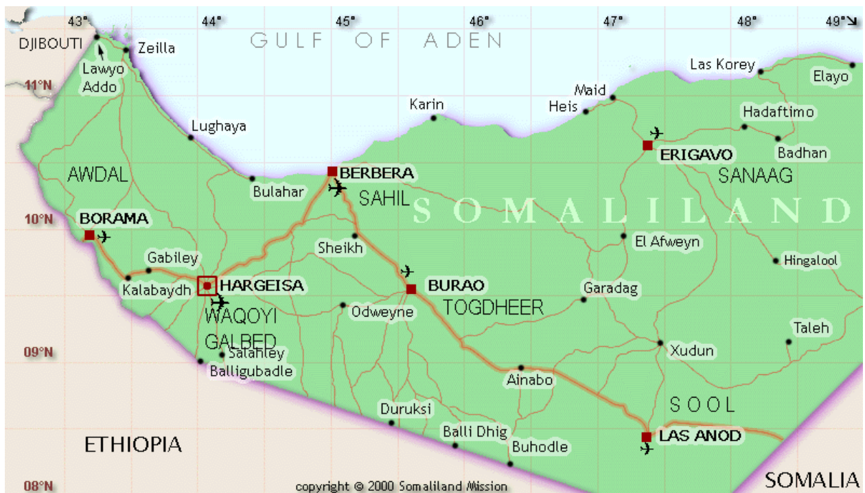
Figure 1: The regions making up Somaliland /2000 Somaliland Mission.

After Somaliland declared itself an independent nation in 1991, it embarked on an impressive process of reconciliation and reconstruction. The achievements of the latter include the preservation of relative peace and stability as well as the advancement of a democratic political system. This, in turn, has opened up opportunities for progress on a number of reforms and development agendas and innovations, driven by a mix of public and private sector actors, also of importance for climate change related matters (from local governance, poverty alleviation, infrastructure, assistance to the rural sectors, emerging new markets etc.). In sum, Somaliland is currently a fast-changing context, within which significant economic, political and environmental challenges and constraints, combined with a number of opportunities and innovations, deserve further attention.