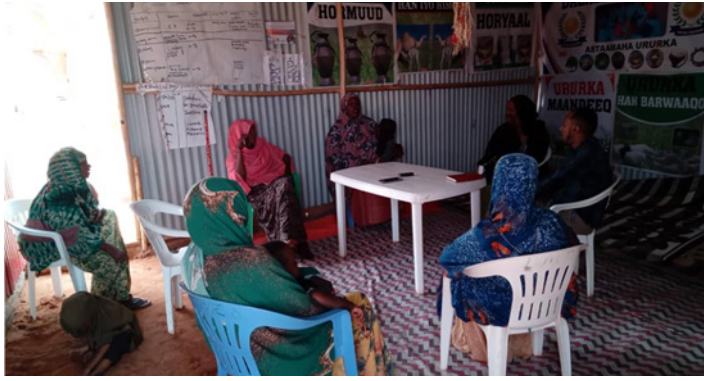
Focus Group Discussion with IDP women