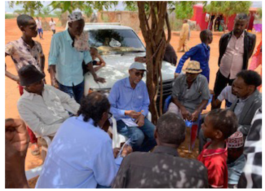
Focus Group Discussion in Burao