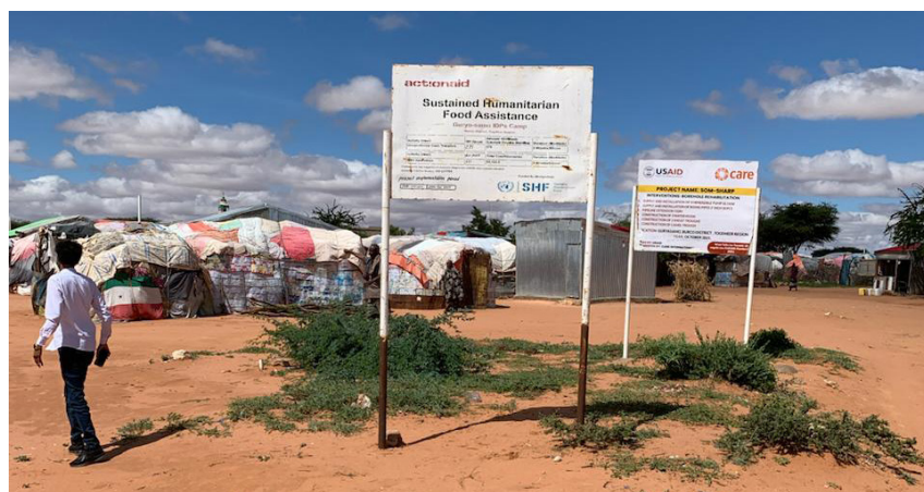
Burao IDP camp

This study is based on field research in Togdheer region (in camps in Burco and Odweyne) and in Sool region (in the camp in Caynabo), as well as interviews with key international agencies involved in programming for IDPs. Research methods included field observations, key informant interviews and focus group discussions with IDPs, government authorities (local, regional, and central), and humanitarian actors. In addition, a stakeholder workshop in Hargeisa, bringing together a group of 28 participants from all public stakeholder institutions, provided significant feedback on the study. To visualize our data, we have used GIS mapping of IDP settlement distribution sites around Burco Municipality.